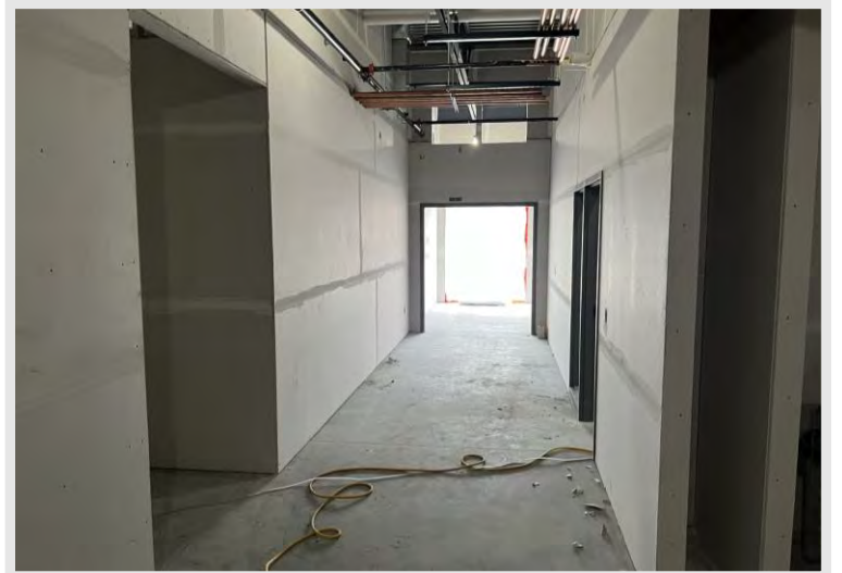
Drywall installation and finishing will be moving quickly over the next few weeks to prepare spaces to receive paint.