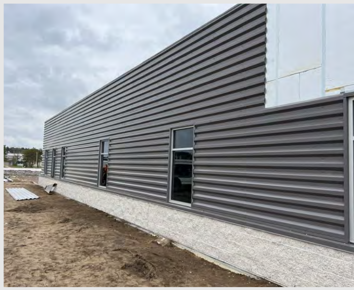
Metal panel install continues overtop of the foam insulation and soon the exterior of the build will receive the metal panel trim.