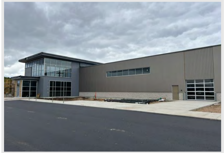
The asphalt binder course was installed adjacent to the site concrete and notice the overhead door installed in the right side of the image!

At the exterior, the masons have completed the trash enclosure and brick veneer, and now have started the stone veneer installation at the main entrance. Metal panel installation is ongoing around the west elevation of the building. The site concrete has wrapped up to make way for asphalt. This allowed the binder course of asphalt to be installed on portions of the project and will finish out in the coming weeks. We have seen this project move quickly as we head towards the fall and winter months with all the site and enclosure work taking place!