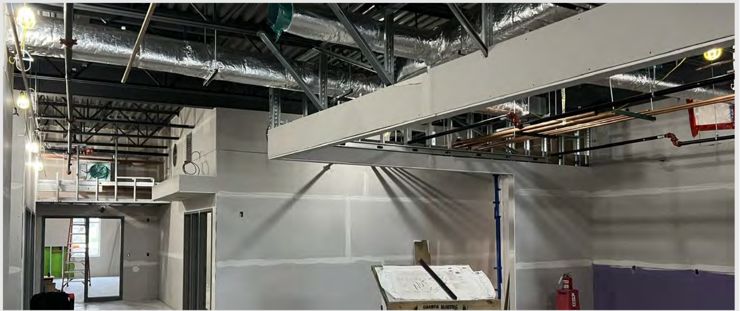
Overhead mechanical, electrical, plumbing, and fire protection trades have started to take off in sequence with the drywall. Notice all the different systems in the above photo – it takes a lot to bring a project to life!