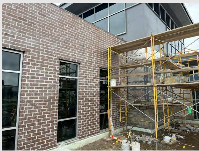
The masons have finished installing the brick veneer and have started installing the stone veneer seen behind the scaffold.