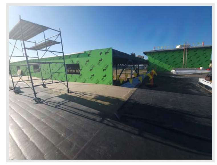
Roof membrane has been laid down on the majority of the building with only parapets remaining to be installed after they are completed.